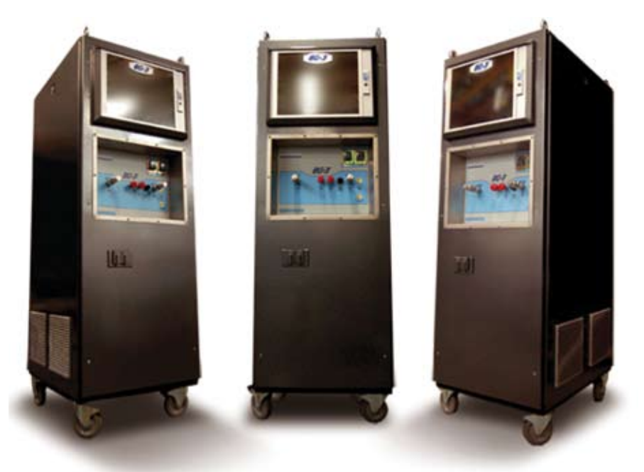
Figure 1: The BG-3 offers a world-class system for engine development at a fraction of the cost of a CVS system

With the BG-3's partial flow sampling technology, engine manufacturers now have a world-class system for engine development at a fraction of the cost of a CVS system, with proven equivalent mean results and improved repeatability, which ultimately translates into lower engine development costs. According to Rob Graze, senior