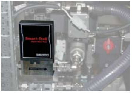
Figure 4: A Smart-Trak mass-flow meter and controller

Troubleshooting a wide range of engine sizes on any existing test cycle is easily handled with the BG-3. The physical size, cost, and relative difficulty in maintaining, operating, and troubleshooting a CVS system, however, is intensified as attempts are made to extend the use of a CVS to engines with greater power output. Since CVS shows a 'history' to engines previously sampled due to mass transfer from the tunnel walls, troubleshooting becomes