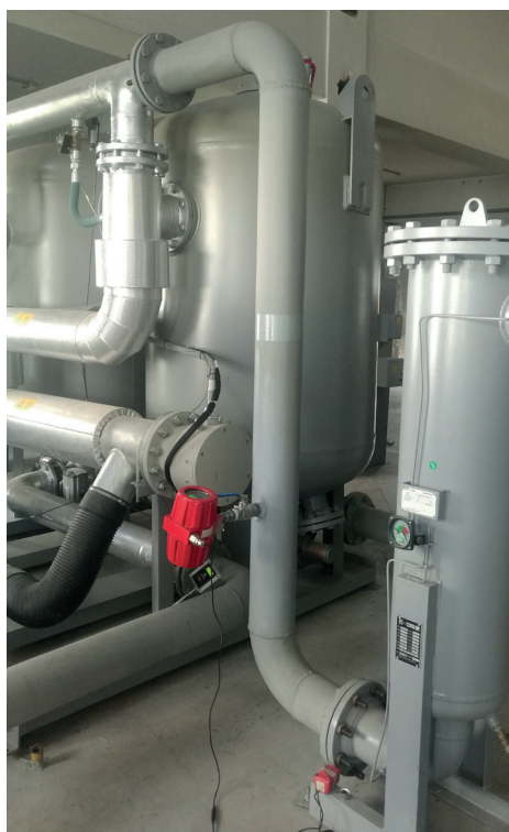
A thermal mass flowmeter measuring compressed air

single supplier for many energy metering applications by offering three types of flowmeters that measure steam, air, gas, and water. Sierra's thermal flowmeters measure both gas flow and compressed air. The company offers vortex flowmeters that measure steam, gas, and water flow. Sierra's clamp-on ultrasonic flowmeters provide a flexible method for measuring liquid flows. And Sierra offers software apps that can be used with all three meter types. Examples include ValidCal Diagnostics for field validation, Datalogging, and MeterTuning.