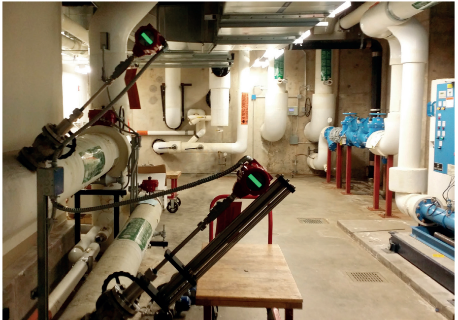
A multivariable insertion vortex flowmeter for stream applications

One example of this type of metering is at Marina Bay Sands, a luxury hotel in Singapore. Kamstrup has installed more than 1,500 units of electricity, water, and cooling meters in this hotel.