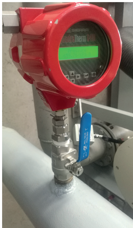
A closer look at the thermal mass flowmeter

Sierra ties its three solutions together through its proprietary Raptor operating system. This system consists of firmware along with software apps that run on its thermal, vortex, and ultrasonic flowmeters, which it calls the Big-3. The Big-3, together