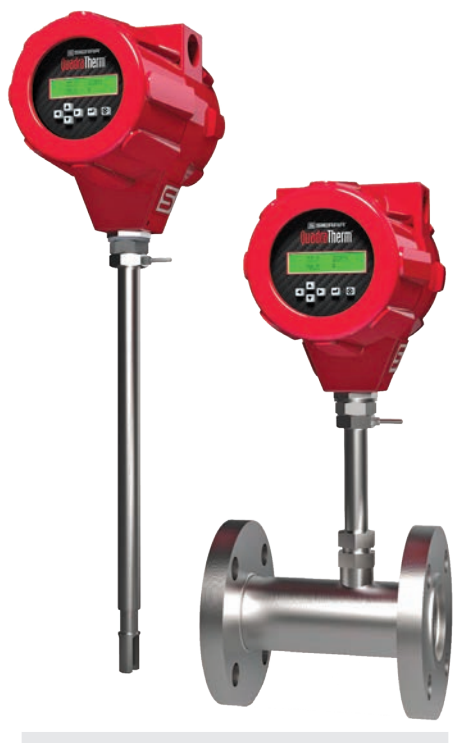
Sierra Instruments' QuadraTherm 640i/780i Thermal Mass Flowmeter with four-sensor technology

This algorithm calculates stem conduction and all other unwanted heat-